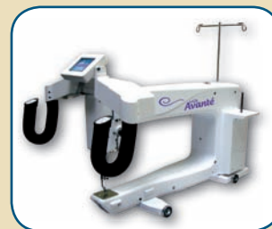
HQ 18 AVANTÉ®