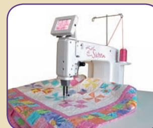
HQ SWEET SIXTEEN® Sit-down