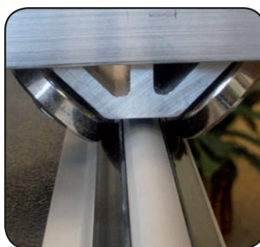
PRECISION-GLIDE ALUMINUM TRACK SYSTEM

SEE YOUR TRAINED HQ REPRESENTATIVE FOR DETAILS.