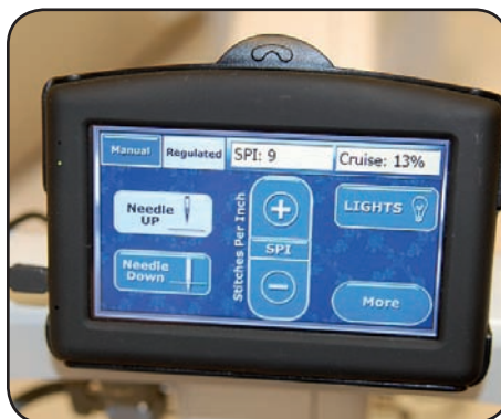
COLOR TOUCH-SCREEN ON FRONT AND BACK HANDLEBARS