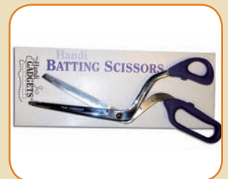
HQ BATTING SCISSORS