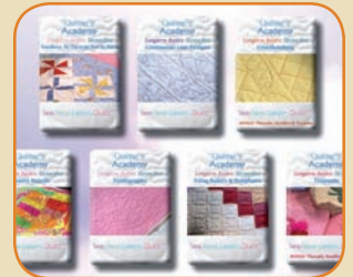
Quilters Academy® DVD SERIES